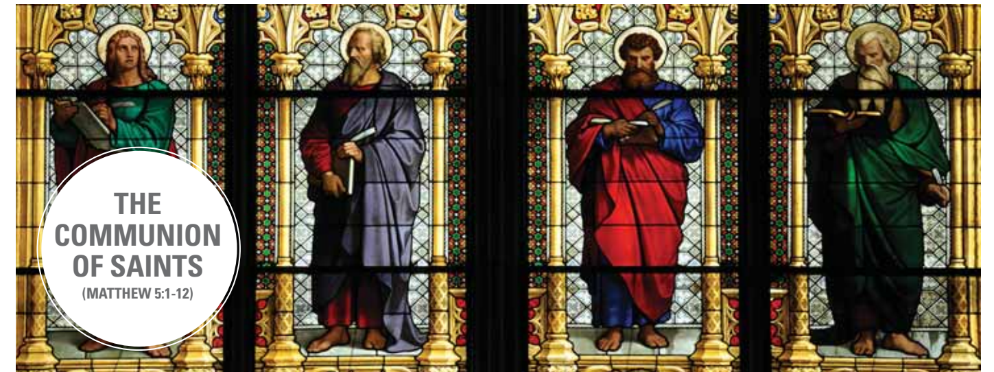
Stained glass window in Cologne Cathedral depicting the four evangelists: St Matthew, St Mark, St Luke and St John