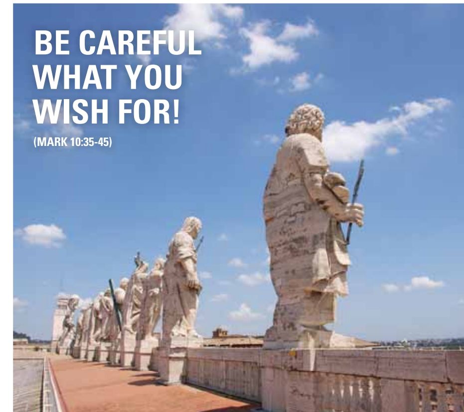
Statues on the façade of St Peter's Basilica in Rome